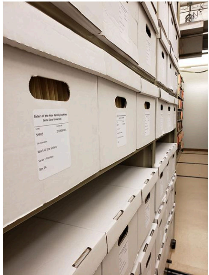
Archival documents from the Sisters of the Holy Family of California are preserved in the Archives and Special Collections of the Santa Clara University Library.